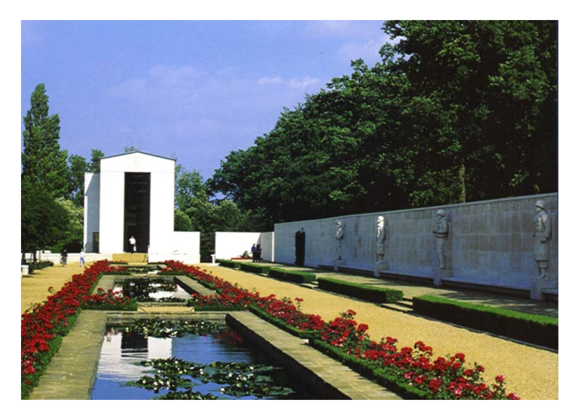
Wall at Cambridge American Cemetery Where the Seven MIA Crewmember are Listed

Most of the 3,812 Americans currently buried at Cambridge were crew-members of American aircraft. The Wall at the cemetery contains the names of 5,126 MIA including the seven names of George's fellow crew-members. After the war in 1945 approximately 9,000 Americans had been buried at the cemetery. In 1948, the next-of-kin were given the option to move the remains of their loved ones to any military or private cemetery in the United States.